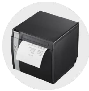
Front Paper Loading