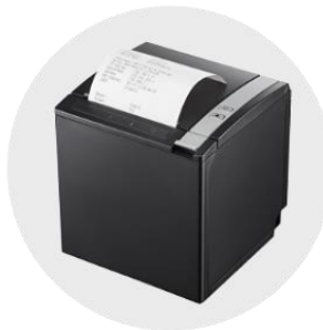
Top Paper Loading